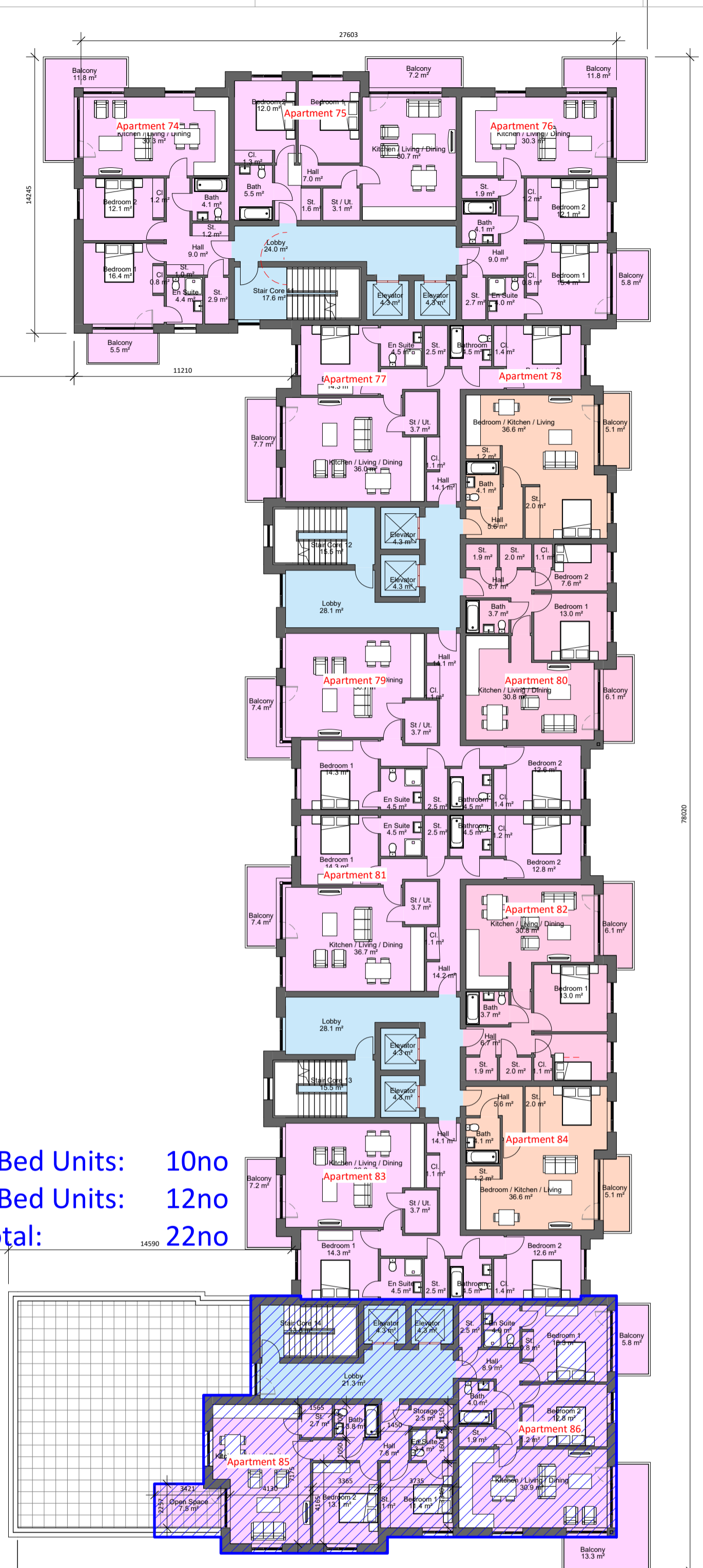
Sector 7 Block 3

1-Bed Units: 10no 2-Bed Units: 12no Total: 22no