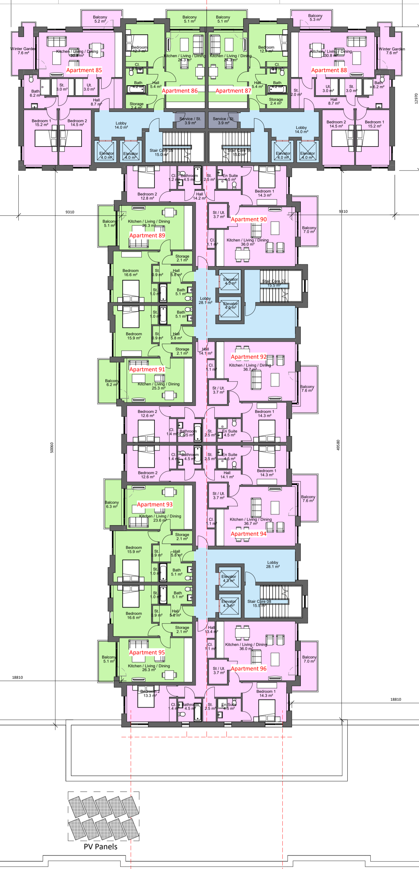
Sector 7 Block 2